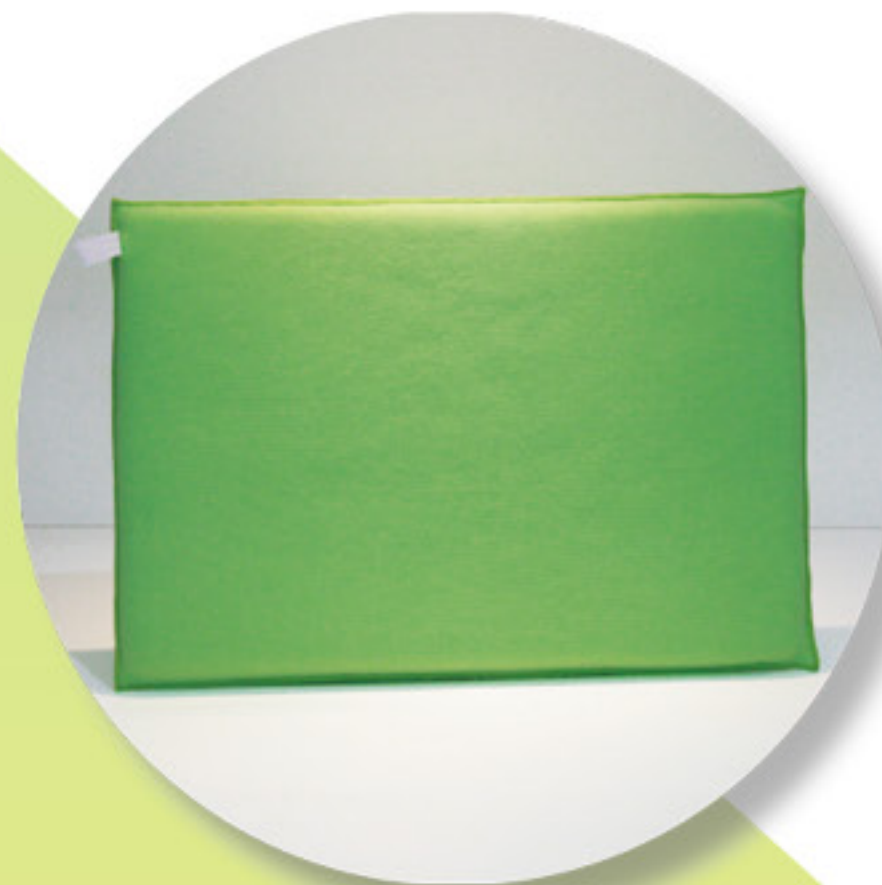
RG570-S1 60 x 40 cm