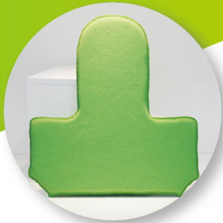
RG560-SH2 52 x 47 cm